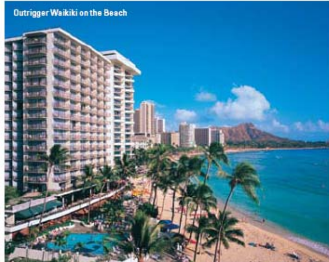
Outrigger Waikiki on the Beach