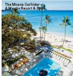
The Moana Surfriider - A Westin Resort & Spa